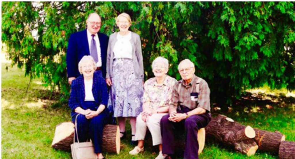
Founders at the ground breaking for the remodeling of fellowship .